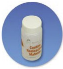
Uncalibrated Liquid Standards