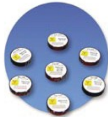
Uncalibrated Solid Sealed Standards