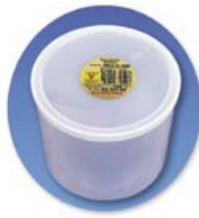
Calibrated Multi-Gamma Standards