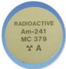
Alpha/Beta Low Background Standards