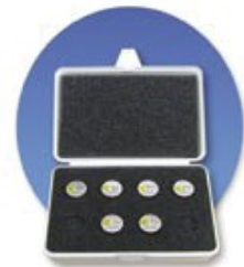
Homeland Security Standards Rugged and reliable button check sources that represent gamma energies of interest