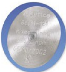
Calibrated Multi-Alpha Standard