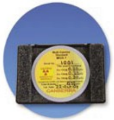
Calibrated Single Gamma Standards